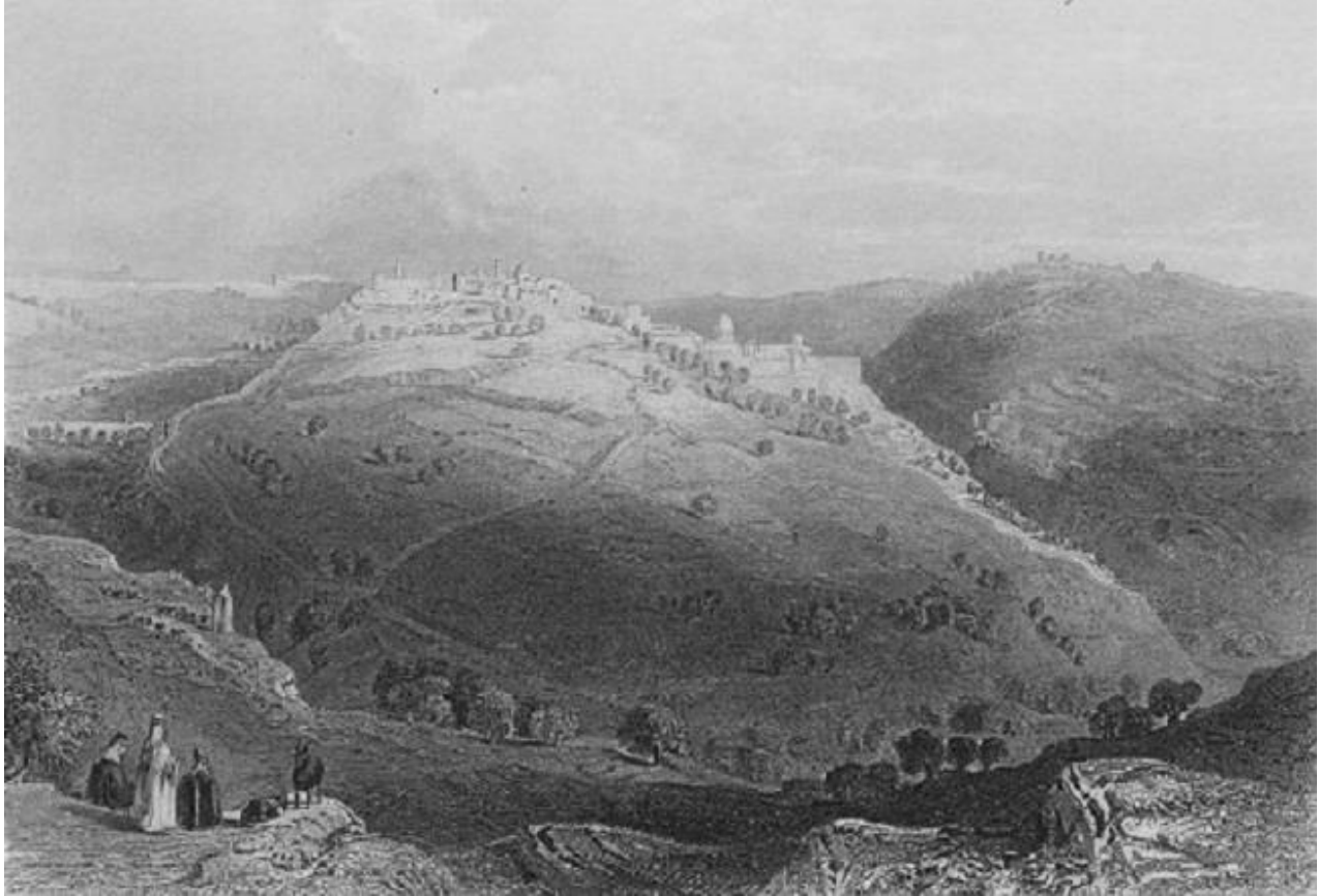
Mount Zion by William Bartlett, 1847.